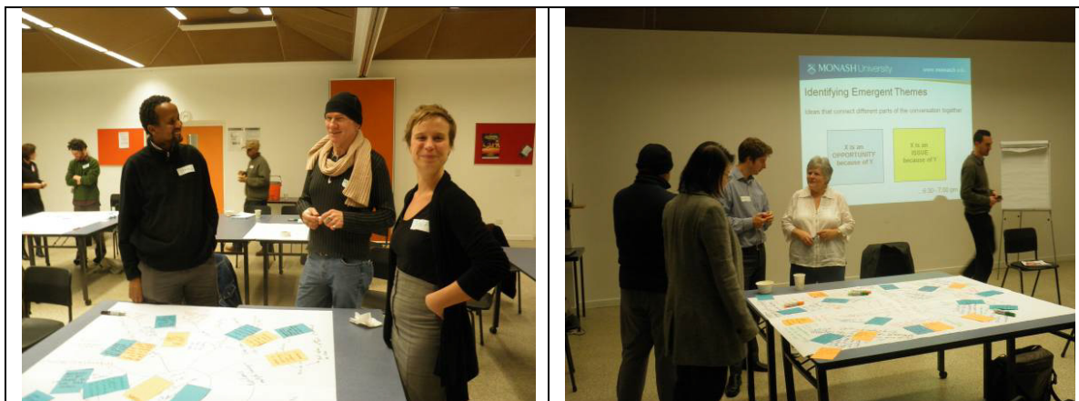
Images 1 and 2: Scenes from the workshop with City of Melbourne Cast Study interviewees.

This report summarises key aspects of discussions held during a three hour workshop conducted as part of work package 4 of the VCCCAR funded research project ‘Framing multi-level and multi-actor adaptation responses in the Victorian context’ (‘the Framing Adaptation project’), ‘Exploring local stories of environmental change and adaptation’ (‘the Narratives work package’). For this workshop, the project team invited residents and interview partners from the suburbs Carlton and Docklands in Melbourne and representatives from the City of Melbourne council.