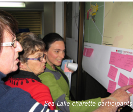
Sea Lake charette participants