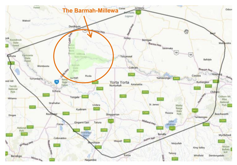
Figure 1: The Yorta Yorta area (grey line) and Barmah-Millewa areas (light green shading).

The Murray River – Dhungala – with its rich network of lagoons, creeks, and wetlands, is regarded as the life source and the spirit of the Yorta Yorta people. Dhungala comprises the lower half of the Murray-Darling Basin and flows out into the Coorong lagoon system. Inflows to Dhungala and its tributaries have their source in the high country in the Basin's south east. The natural flood and drought cycles of the region, driven in part by the El Niño Southern Oscillation (ENSO), mean that the river channels are connected intimately with ecosystems in surrounding floodplains and tributaries. The Barmah Choke, in the heart of Yorta Yorta Traditional Lands (Figure 1), is a region where constricted flows lead to more frequent flooding events, supporting the internationally significant river red gum forests. The floodplains are also locations where bird, amphibian, reptile and fish breeding events take place.