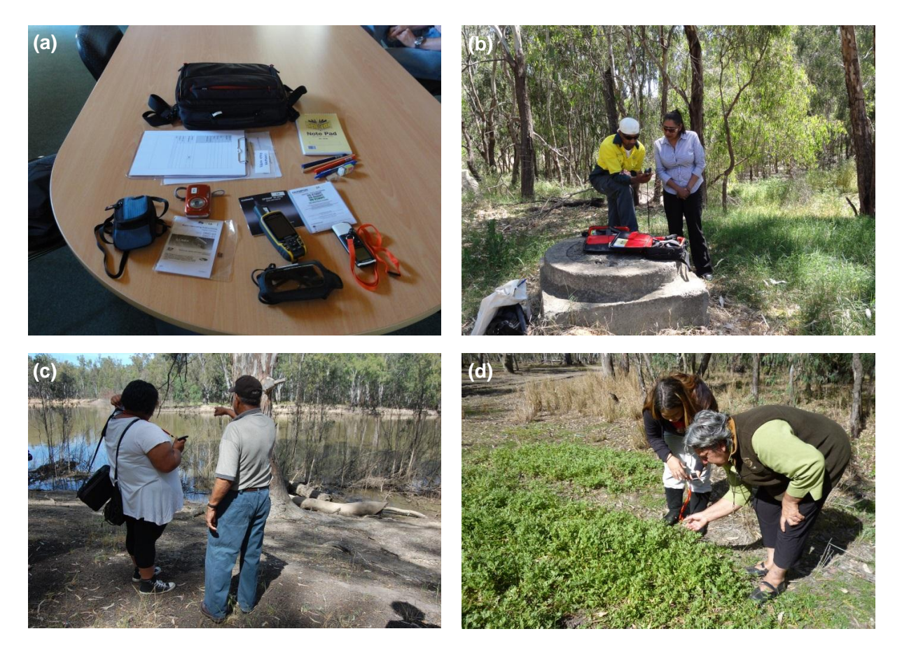
Figure 2: Cultural data collection: (a) equipment, (b) training, (c) & (d) interviews.